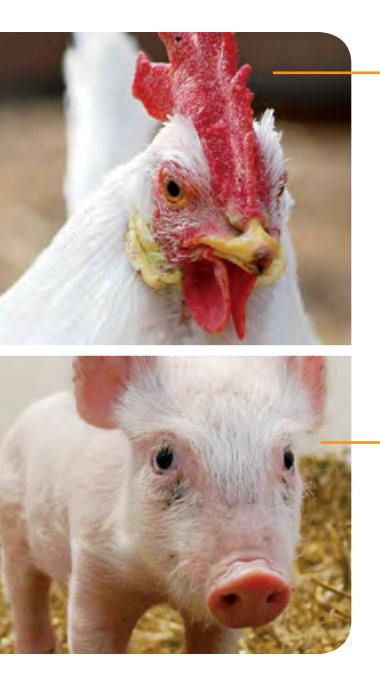
21 chickens like Tilly, and even more if you also cut out eggs

Agriculture economists have found that when people eat less meat, producers raise and kill fewer animals. Here are some of the individuals you help spare each year.