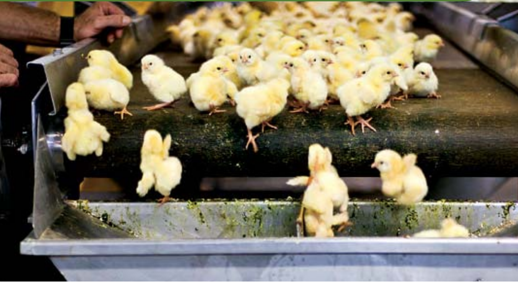
Male chicks like Kevin are killed by being dropped into a giant grinding machine.