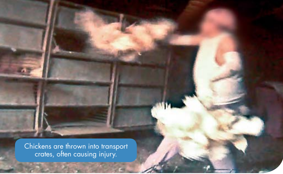
Chickens are thrown into transport crates, often causing injury.