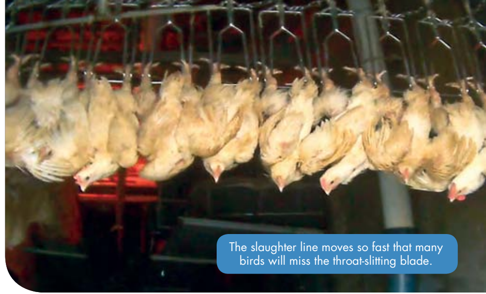
The slaughter line moves so fast that many birds will miss the throat-slitting blade.