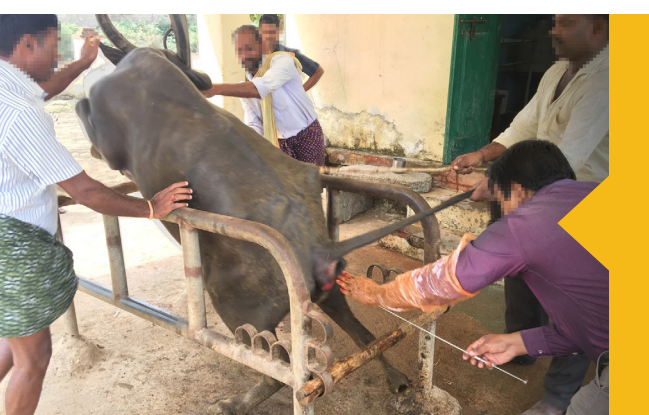
A female dairy cow being forcefully inseminated while restrained.

Forced insemination involves mounting selected bulls on dummy cows, or giving them electric shocks to collect semen and forcibly placing it in cows who are restrained on "rape racks." This is a standard practice at most smalland large-scale dairies in India.