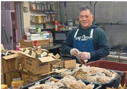
Delivered over 267,000 meals and groceries to food-insecure families in Redwood City, California.