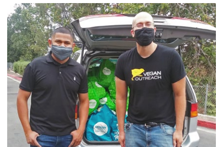
Provided over 6,100 grocery bag meals to members of the LGBTQ North County Resource Center in Oceanside, California.