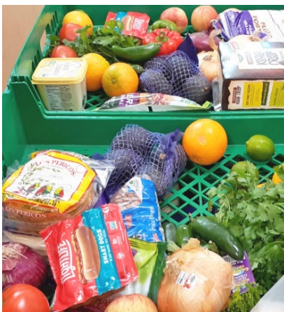
In partnership with the League of United Latin American Citizens Iowa, we've delivered 97,000 meals to those in cities dealing with ICE raids and that were sites of some of the worst COVID-19 factory farm outbreaks in Iowa.