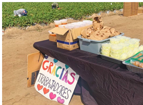
Partnered with the Center for Farmworker Families to provide over 6,200 hot meals and groceries to farmworkers in Watsonville, California.