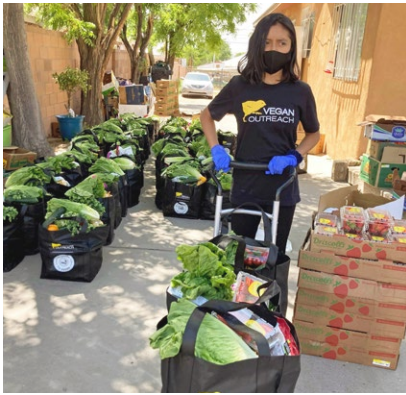
Delivered over 708,000 meals and groceries to Albuquerque families and the Navajo Nation in New Mexico and Arizona.