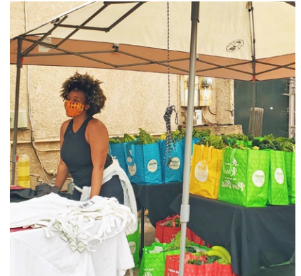
Collaborated with the nonprofits Black Women for Wellness and Black Lives Matter to provide 146,000 hot meals and groceries to families in Los Angeles.