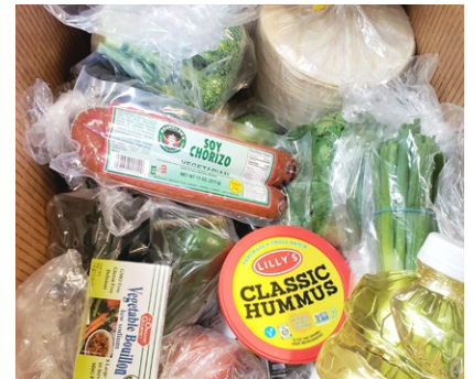
Delivered over 59,000 groceries and hot meals from local restaurants directly to the homes of farmworker families in Dixon, California and food-insecure families in Sacramento and Stockton, California.

With funding from a generous foundation, Vegan Outreach's Vegan Food Aid (VFA) program provides free, fresh vegan groceries and prepared meals directly to food-insecure immigrants, seniors, veterans, farming communities, Native Americans, at-risk LGBTQ members, and low-income households across the US.