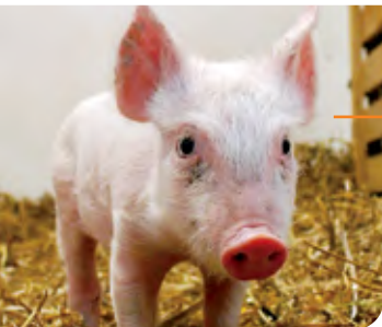
A pig like Bob Harper