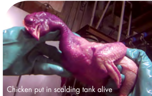
Chicken put in scalding tank alive

At the slaughterhouse, workers jam the birds' legs into shackles that hold them in place upside down on the killing line. Their heads are run through an electrified tub of water, which paralyzes them. The next stage is the automated throat-slitting blade, but many chickens get past the blade without having their throats cut. Some will go on to the next stage—