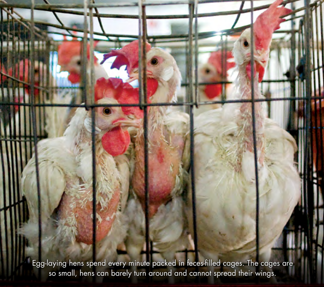
Egg-laying hens spend every minute packed in feces-filled cages. The cages are so small, hens can barely turn around and cannot spread their wings.

Chickens raised for meat spend their lives packed in massive warehouses. Bred to grow extremely fast, by the time they are one month old it's painful for many of them to walk. The ammonia from their own waste is so concentrated it burns their skin and lungs.