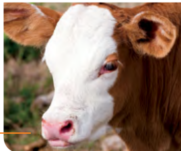
A cow like Meghan