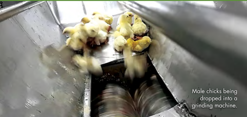
Male chicks being dropped into a grinding machine.