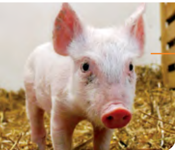
A pig like Bob Harper